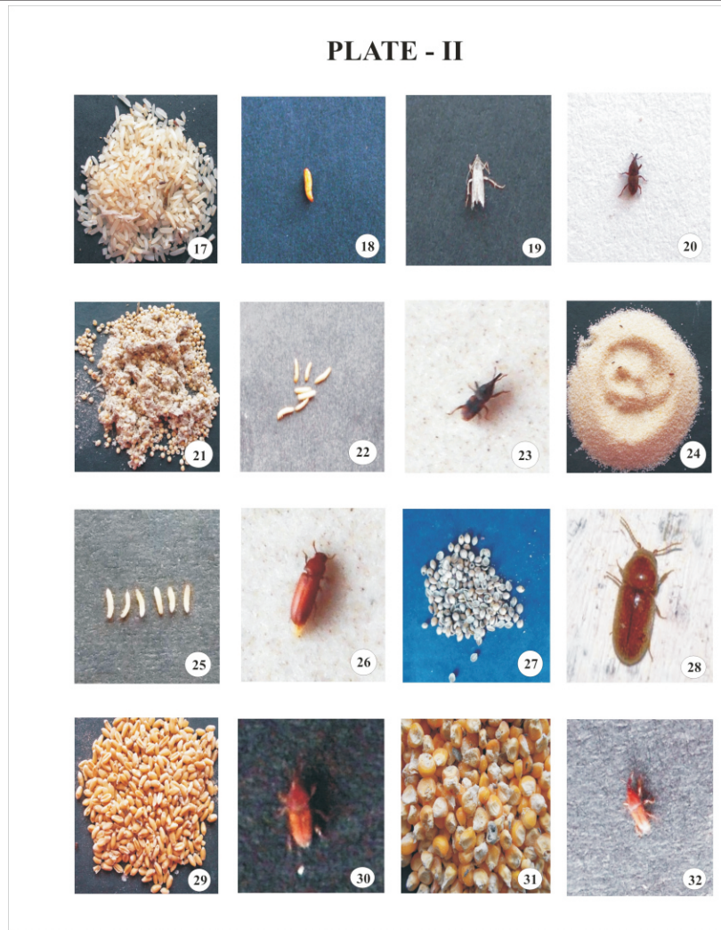
Table: 1 Insect pests collected from various commodities from Karad region.